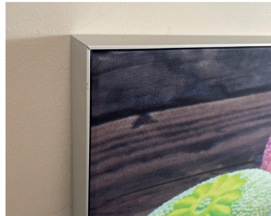
Corner Option 1 - Mitered w/ L Bracket