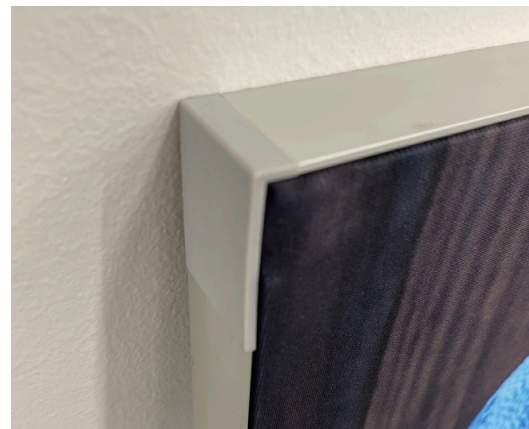
Corner Option 2 - Plastic Corner w/ Lock