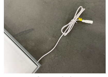
Wire Exit & Barrel Plug